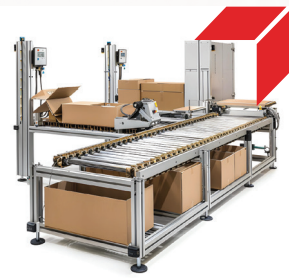
CORRUGATED PACKAGING MACHINERY