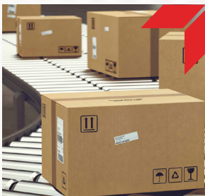
BOX MAKING SOLUTIONS