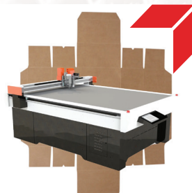
DIE CUTTING SOLUTIONS